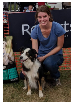
Winners of the Dog High Jump at Exeter Show.