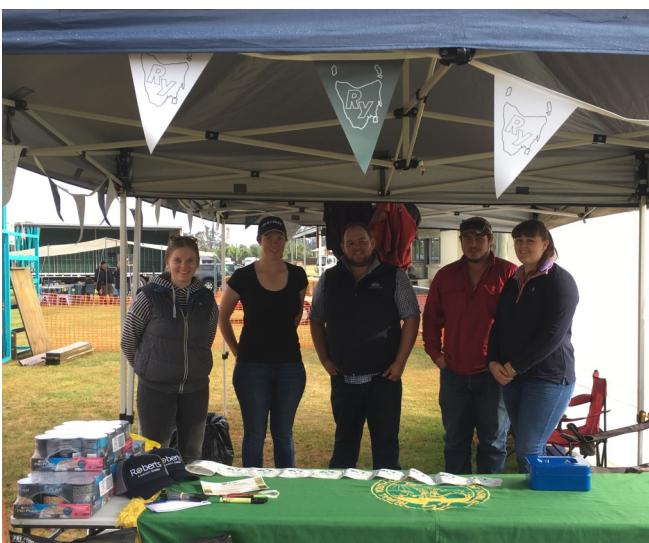
Above: Tamar Club Members

More recently a majority of club travelled to Ulverstone to the State ball, where I hear they all had a fabulous time, a wonderful way to let their hair down and get jazzed up!